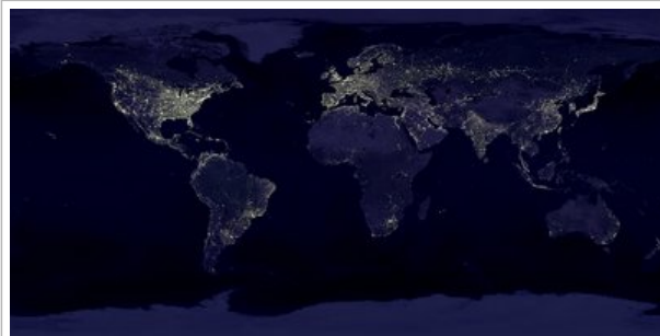
The Earth at night, demonstrating the global extent of human influence.

The Anthropocene defines Earth's most recent geologic time period as being human-influenced, or anthropogenic, based on overwhelming global evidence that atmospheric, geologic, hydrologic, biospheric and other earth system processes are now altered by humans. The word combines the root "anthropo", meaning "human" with the root "-cene", the standard suffix for "epoch" in geologic time . The Anthropocene is distinguished as a new period either after or within the "Holocene", the current epoch , which began approximately 10,000 years ago (about 8000 BC) with the end of the last glacial period.