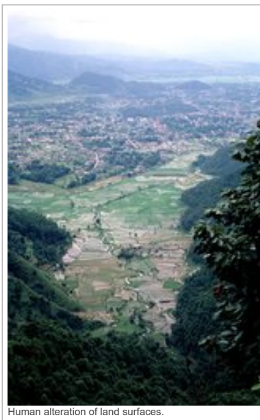
Human alteration of land surfaces.